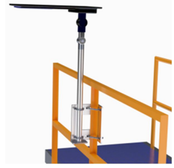
Mount on any Stanchion No need to align with conduit fittings